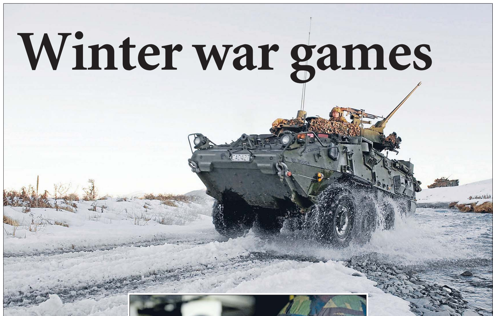
On the charge: An army LAV races across the winter landscape.

In pairs, the LAVs react to a mock ambush and both have a number of targets to hit while on the move. Close behind is the Range Conducting Officer (RCO) LAV. He advises the crews and ensures safety rules are followed.